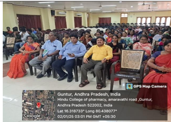
Students & Faculty attended