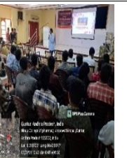
Eminent speakers addressing the students