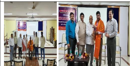
Felicitation to Speakers