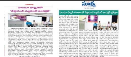
News paper clippings