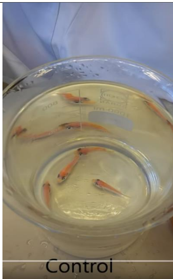
Fishes without Drug