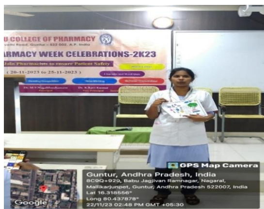
Student Activity presentation's